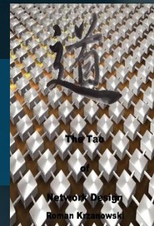
Available in paperback and ebook.